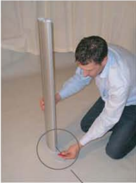
2 Tighten Grub Screws