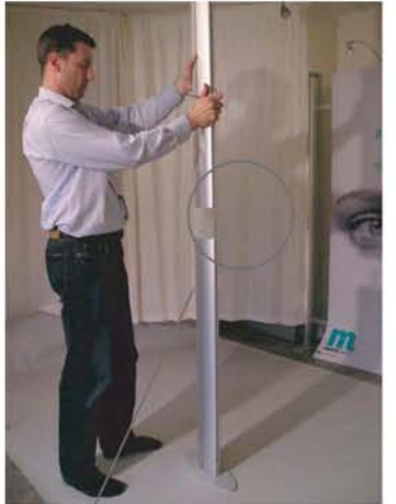
4 Position Upper Post onto Extension Bars