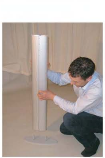
1 Position Posts onto Spigotted Base