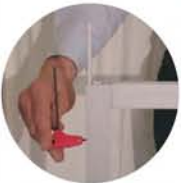
7 Raise Frame Extension Bars into Position