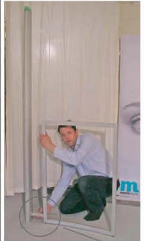
6 Twist Stub Beam into Position