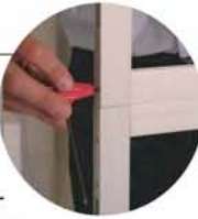
Position Upper Frame onto Lower Frame Extension Bars