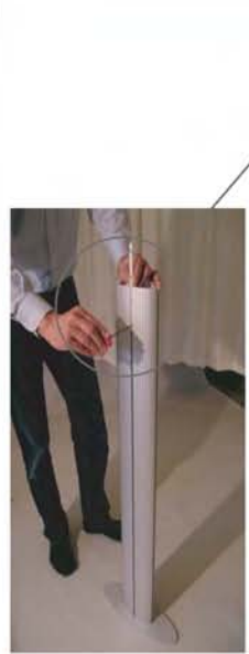
3 Raise Extension Bars and fix into Position