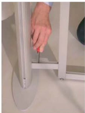
7 Tighten Stub Beam Grub Screws