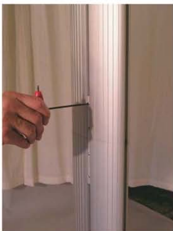
5 Tighten Extension Bar Grub Screws